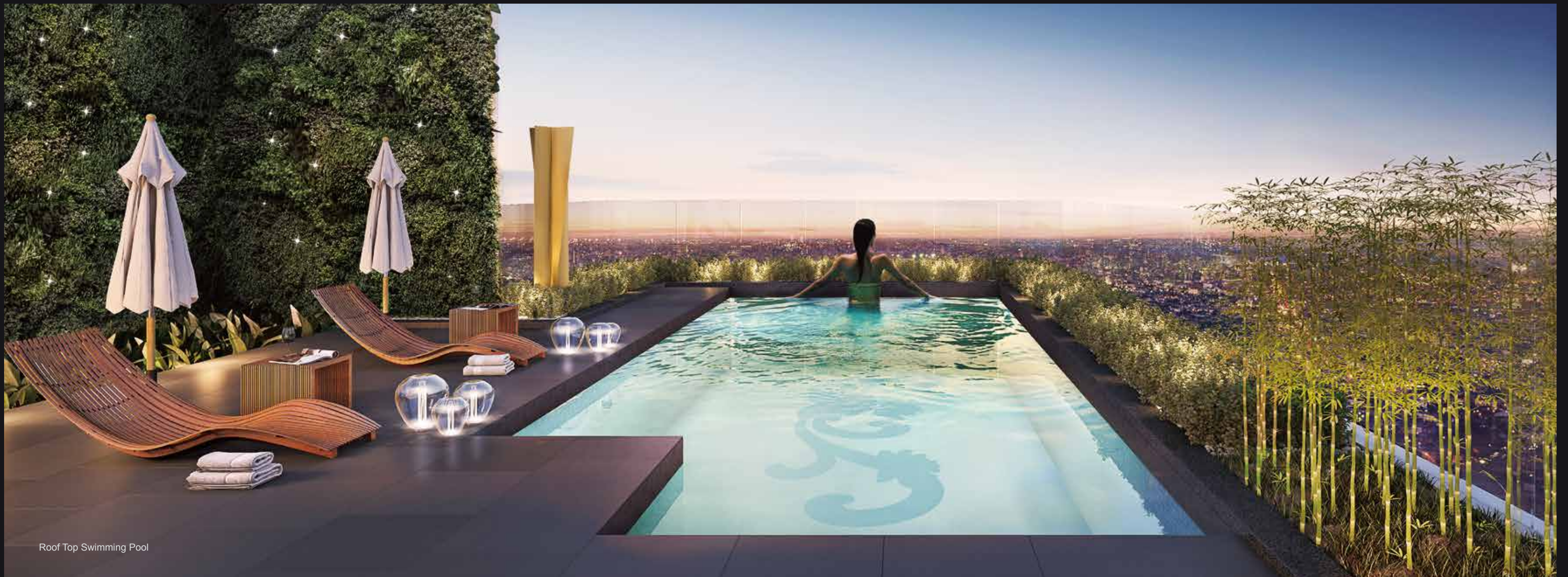
Roof Top Swimming Pool

Apartments of Sky Mansion are equipped with facilities at par with the world super luxury houses. It studies living needs of modern wealthy classes and then configures 27 m 2 swimming pools to penthouses, giving residents exclusively no hassle and a clean swimming pool experience. Whenever you swim alone or with families and friends, Sky Mansion builds a serene retreat to relax yourselves.