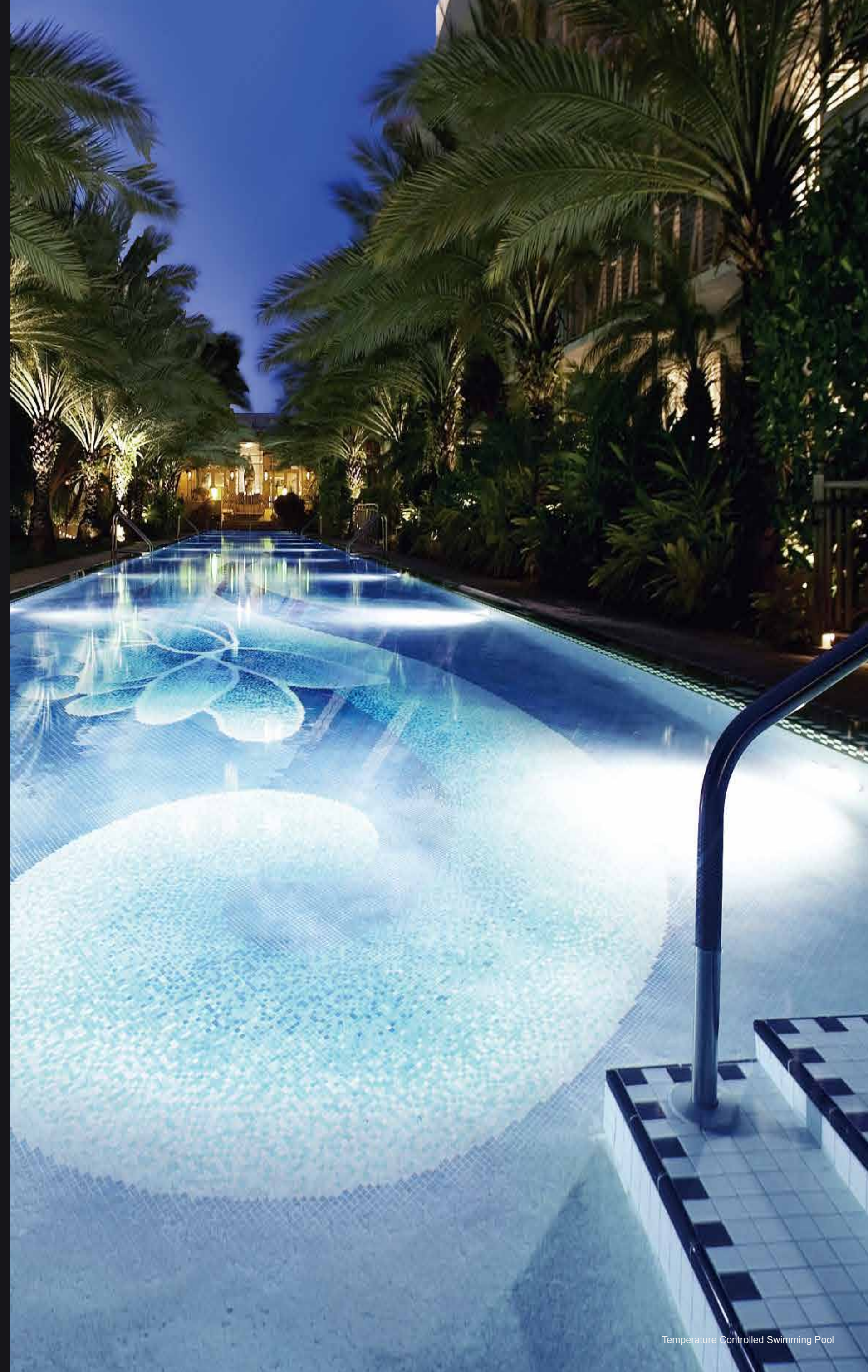
Temperature Controlled Swimming Pool