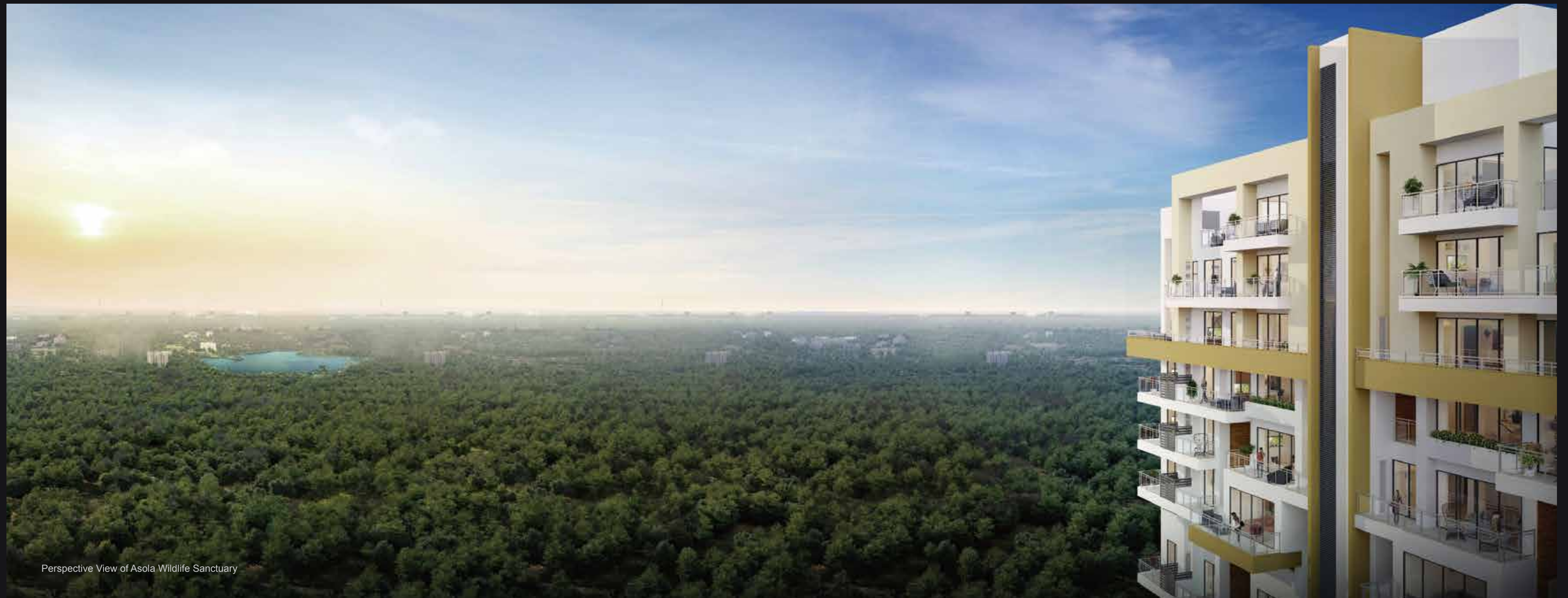
Perspective View of Asola Wildlife Sanctuary