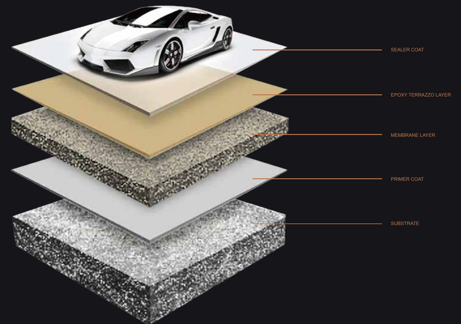
Process of High Quality Epoxy Flooring