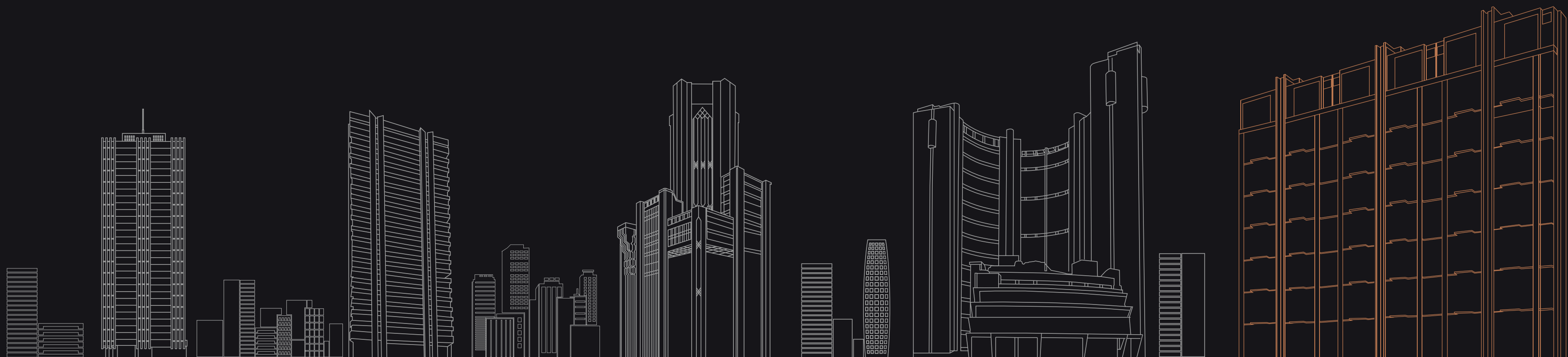
1973 Hindustan Times House 80 meters

Looking back to changes of Delhi's living beacon, from the 1973 designed HT house at 80m height to the 2010 designed Civic center building at 102m height, their towering height, without exception, conveys brand new horizon and elevated high life philosophy to local people, and forms a strong impetus to local residences.